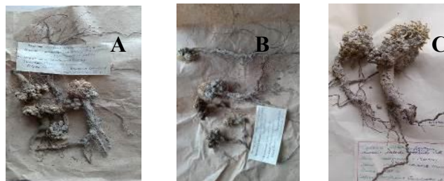
Figure 3. Herbarium of Anabasis cretacea (A, B, and C) of the West Kazakhstan University named after M. Utemisov, Uralsk.