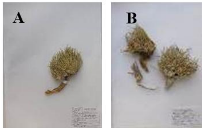
Figure 7. Personal collection of Anabasis cretacea (A-B).