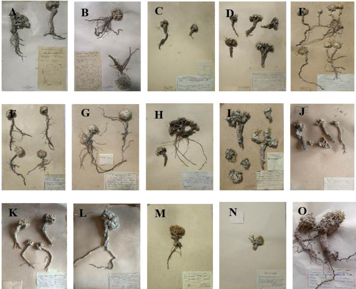
Figure 6. Anabasis cretacea (A-O) stored in the herbarium funds of Kazakhstan and neighboring countries.