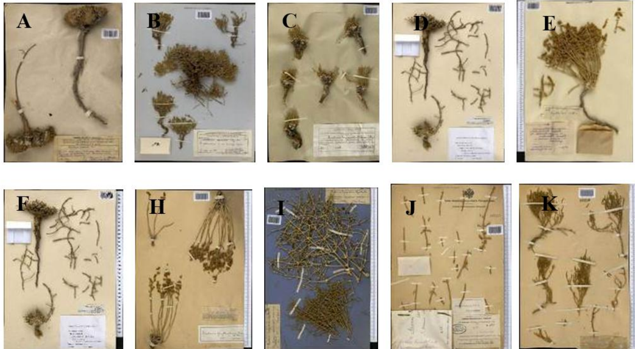
Figure 4. Herbarium of the genus Anabasis L., Moscow State University named after V.M. Lomonosov. 10 species found in Kazakhstan: Anabasis cretacea Pall. (A), A. aphylla L. (B), A. salsa (C), A. truncata (D), A. gypsicola (E), A. ebracteolata (F), A. elatior (H), A. eriopoda (I), A. turgaica (J), and A. jaxartica (K).