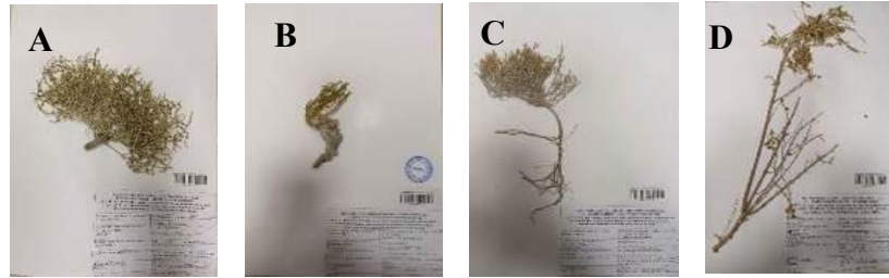
Figure 1. Genus Anabasis L. with four species: Anabasis salsa (A, D), A. cretacea (B), and A. aphylla (C) in the herbarium of the Astana Botanical Garden.