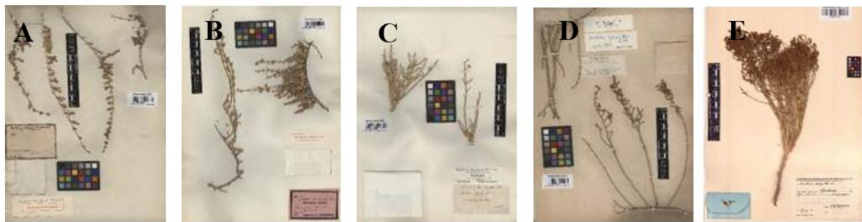
Figure 5. Komarov Botanical Institute of the Russian Academy of Sciences (BIN RAS): Anabasis ehrenbergii (A), A. zoharyi Iljin (B), A. haussknechtii Bge (C), and A. syriaca I (D); Central Siberian Botanical Garden of the Siberian Branch of the Russian Academy of Sciences – A. aphylla (E).