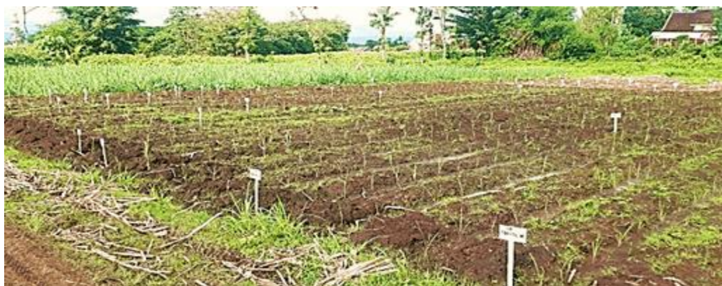
Figure 1. RC-1 polycross population in the field research.

Plant maintenance included land clearing, trimming, root pruning and removal, fertilization, weeding, bulking, irrigation, shoot thinning, and pest control. Fertilization took place at 3–4 weeks and again at 3–4 months in furrows, using a dosage of 600 kg Phonska and