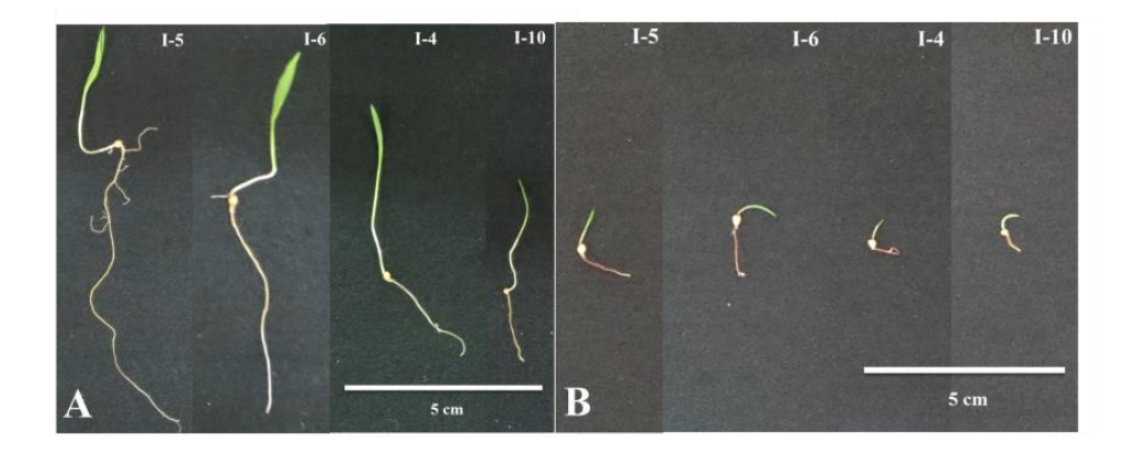
Figure 2. Root and shoot growth differences between four foxtail millet genotypes (I-5, I-6, I-5, and I-10) under drought (A) or salinity stress (B).